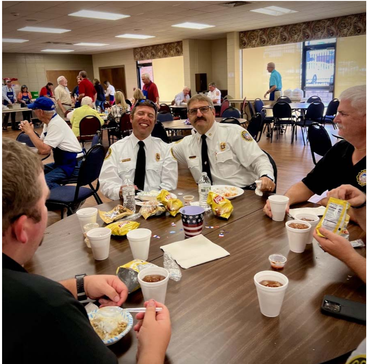
Some of the nearly 500 first responders who attended our First Responders' Luncheon